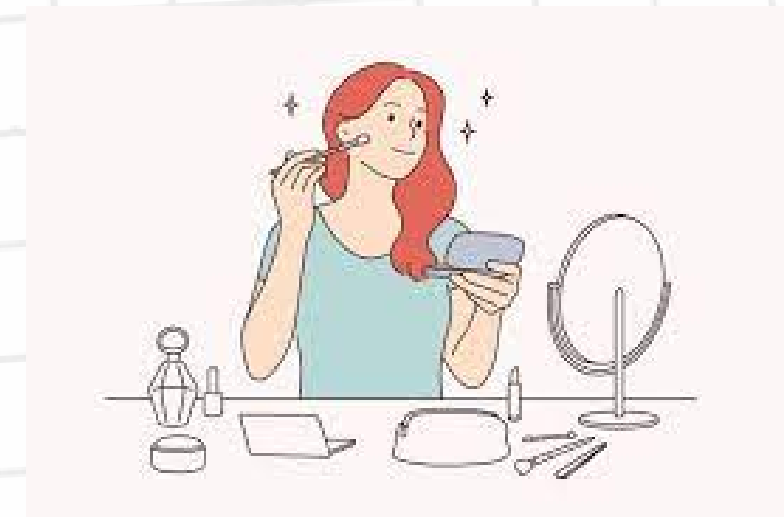
I CAN PUT ON VERY NICE MAKEUP