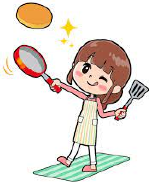
I CAN MAKE CUTE PANCAKES