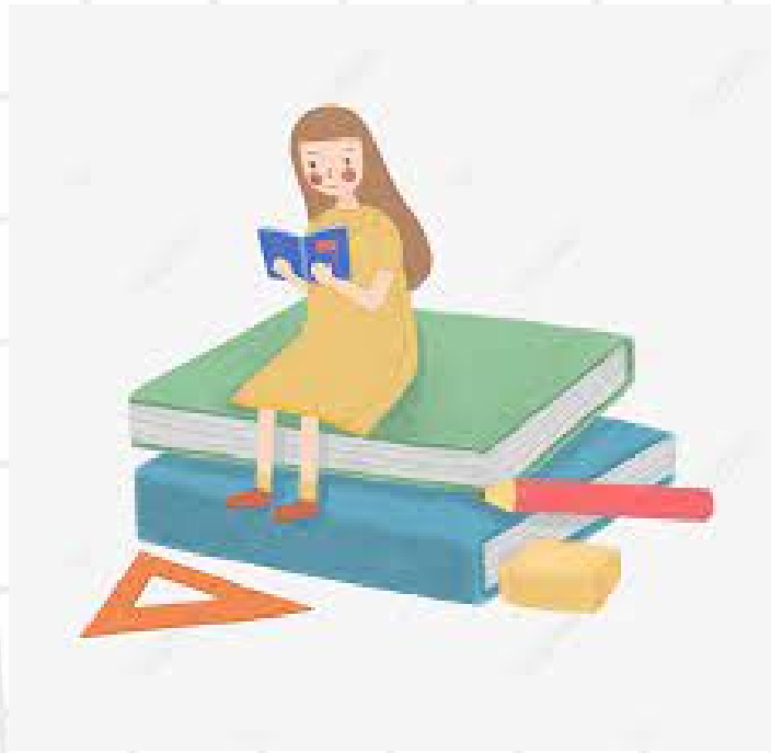
I CAN LEARN VERY QUICKLY