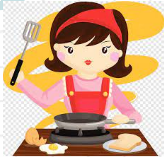
I CAN COOK VERY WELL