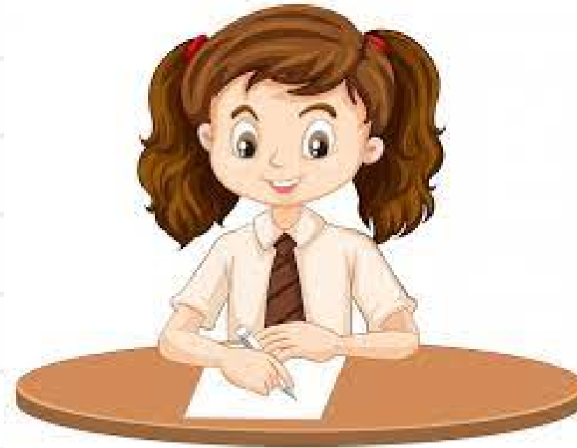
I CAN WRITE BEAUTIFULLY