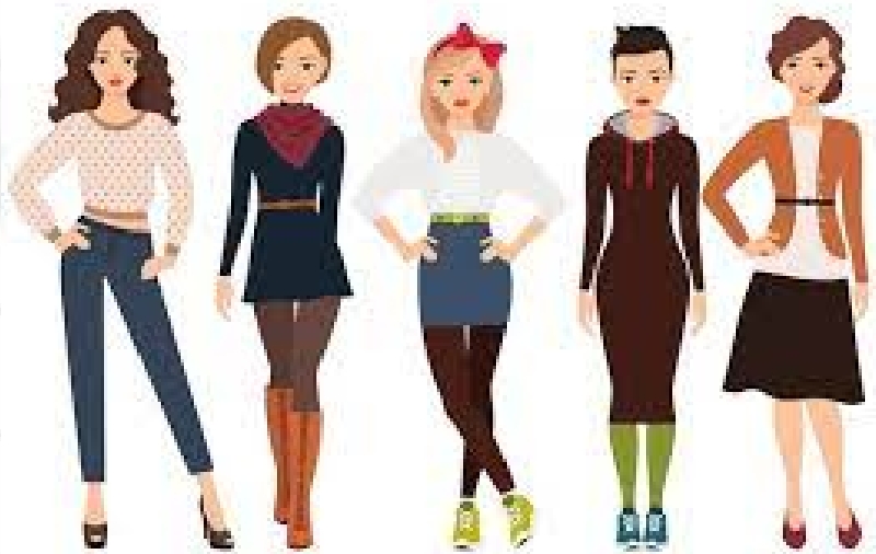
I CAN DRESS NICE