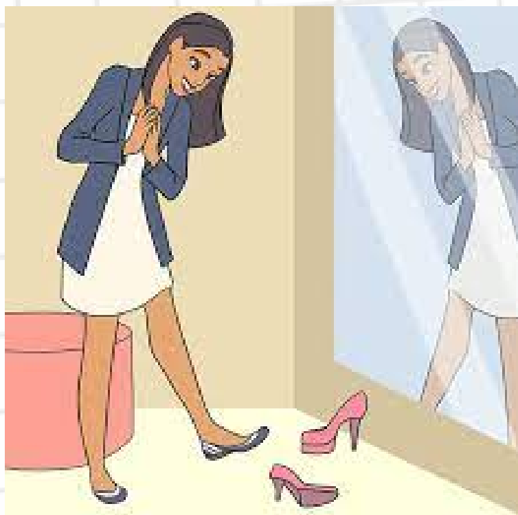
HANNIA CAN'T WALK IN HIGH HEELS