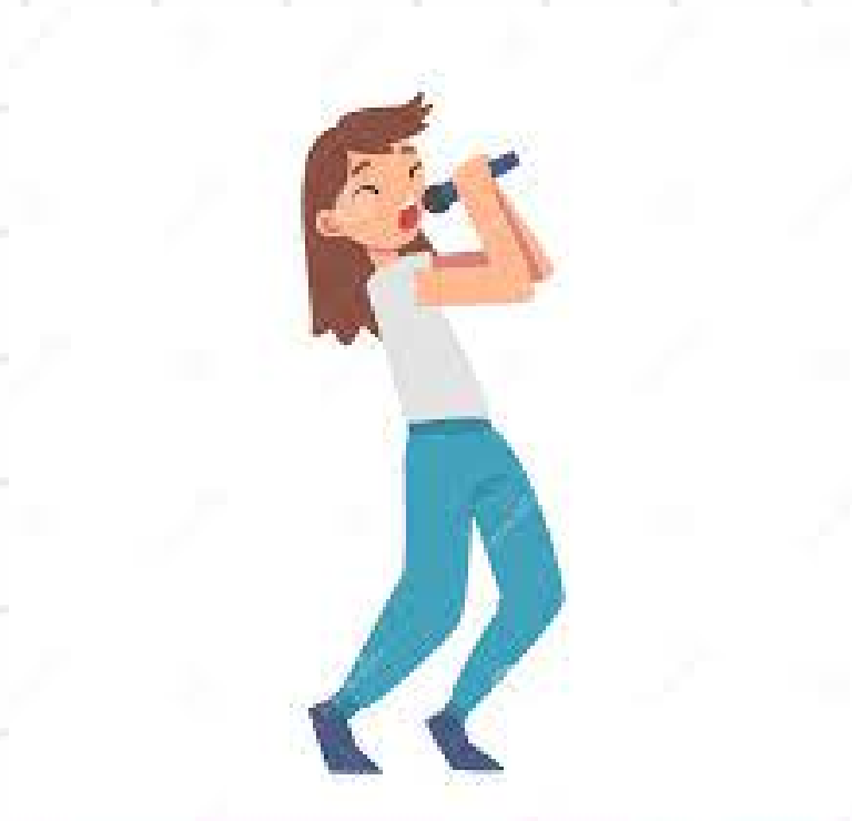
I CAN SING