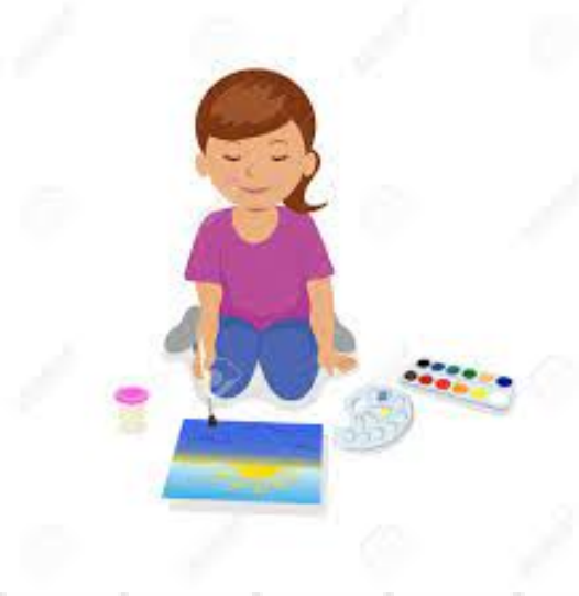
I CAN PAINT VERY WELL