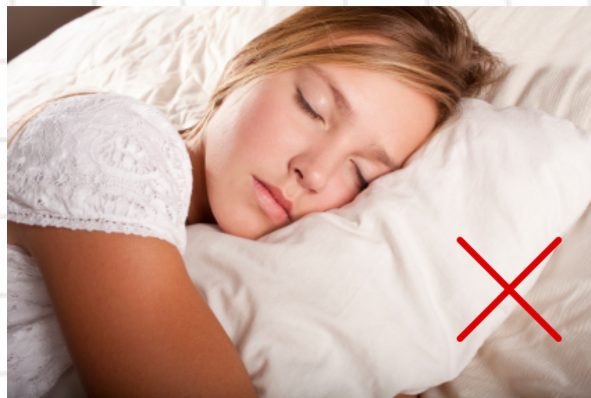
I CAN'T SLEEP TOO LATE