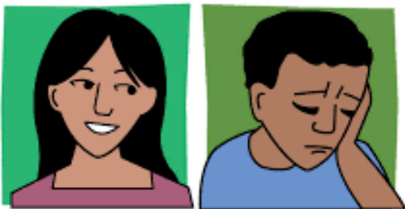
I CAN'T BE SENTIMENTAL