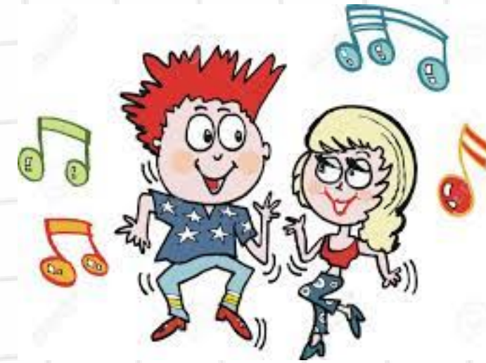
I CAN DANCE TO ALL KINDS OF MUSIC