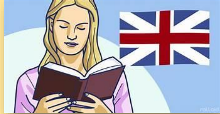
I CAN READ IN ENGLISH