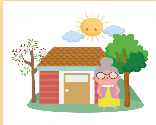
I CAN GO TO MY GRANDMA'S HOUSE