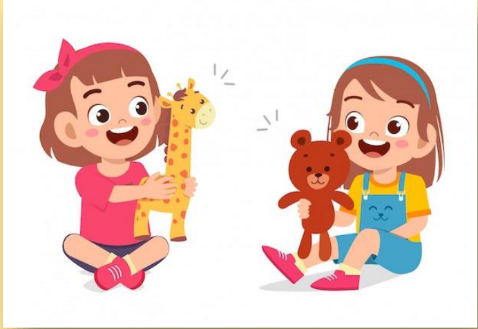
I CAN PLAY WITH MY COUSIN