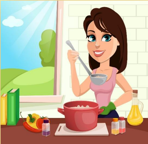
I CAN PREPARE A INSTANT SOUP