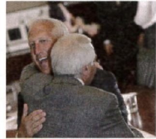
and some hug.