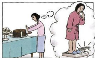
I'm avoiding sugar.