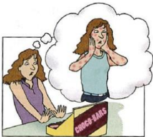
I'm allergic to chocolate.