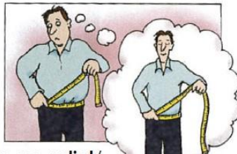
I'm on a diet / I'm trying to lose weight .