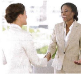
Some shake hands.