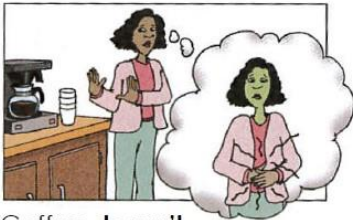
Coffee doesn't agree with me .