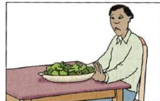
I don't care for broccoli.

Exercise 5. Escribe 7 oraciones usando las palabras en negritas.