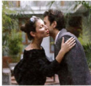
Some people kiss once. Some kiss twice.