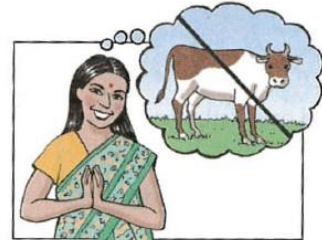
I don't eat beef. It's against my religion .