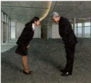
Some people bow.

People greet each other differently around the world.