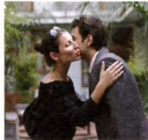
Some people kiss once. Some kiss twice.