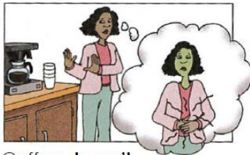
Coffee doesn't agree with me.