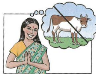
I don't eat beef. It's against my religion.