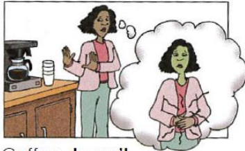
Coffee doesn't agree with me.