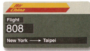
a non-stop flight