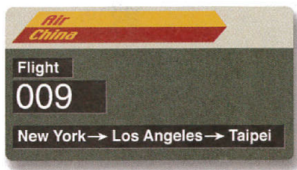
a direct flight