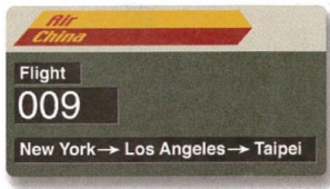
a direct flight