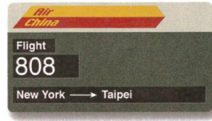
a non-stop flight