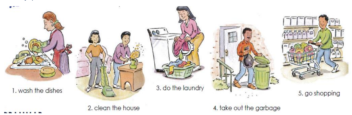
Exercise 2. Write 5 questions using questions with "how often" in present simple (Escribir 5 oraciones usando las preguntas "how often" en presente simple usando el vocabulario debajo)

Example: How often do you travel to Tuxtla?