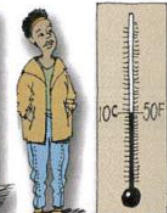
9. It's cool.

Exercise 1. Translate the vocabulary. (Traduce el vocabulario de la parte de arriba)