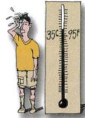
6. It's hot.