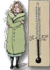
7. It's cold.