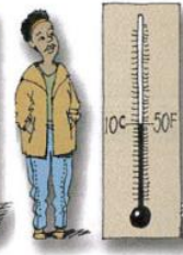
9. It's cool.

Exercise 1. Translate the vocabulary. (Traduce el vocabulario de la parte de arriba)