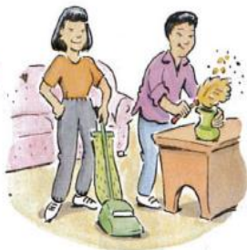
2. clean the house