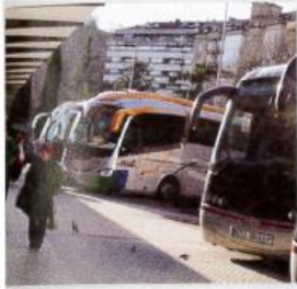
1. a bus station