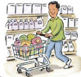
5. go shopping

Exercise 2. Write 5 questions using questions with "how often" in present simple (Escribir 5 oraciones usando las preguntas "how often" en presente simple usando el vocabulario debajo)