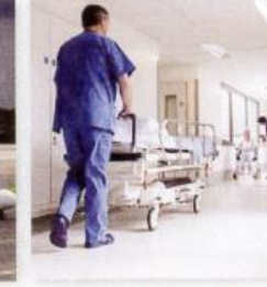
8. a hospital