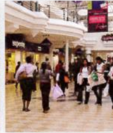
5. a mall