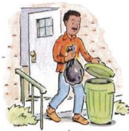
4. take out the garbage