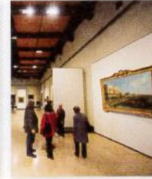
6. a museum