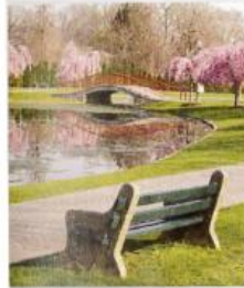
4. a park