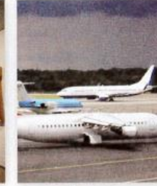
7. an airport