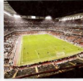
3. a stadium