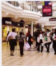
5. a mall