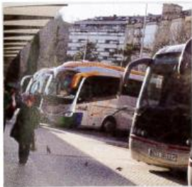
1. a bus station

Escribe 6 preguntas con sus repuestas usando "Where" y el vocabulario debajo.