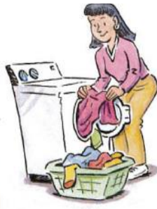
3. do the laundry