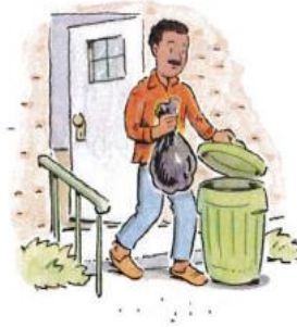
4. take out the garbage