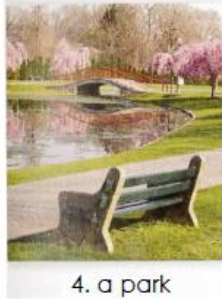
4. a park