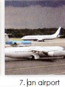
7. an airport