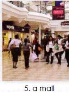
5. a mall