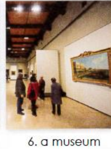
6. a museum