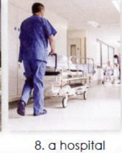
8. a hospital