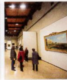
6. a museum