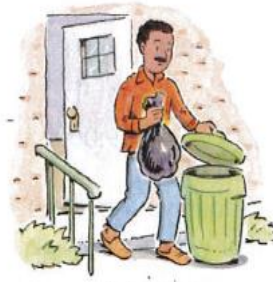
4. take out the garbage