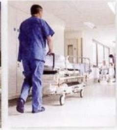
8. a hospital