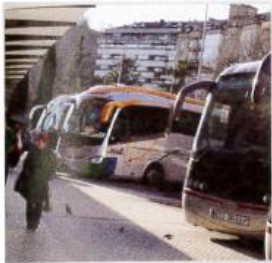
1. a bus station

Escribe 6 preguntas con sus respuestas usando "Where" y el vocabulario debajo.