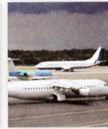
7. an airport