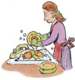
1. wash the dishes

Exercise 2. Write 5 questions using questions with "how often" in present simple (Escribir 5 oraciones usando las preguntas "how often" en presente simple usando el vocabulario debajo)