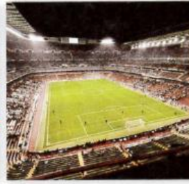
3. a stadium