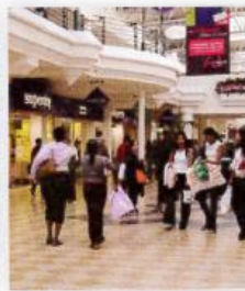
5. a mall