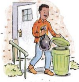
4. take out the garbage