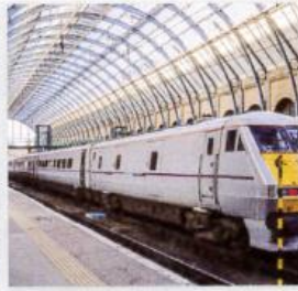
2. a train station