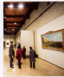
6. a museum