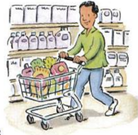
5. go shopping

Exercise 1. Translate the vocabulary. (Traduce el vocabulario de la parte de arriba)