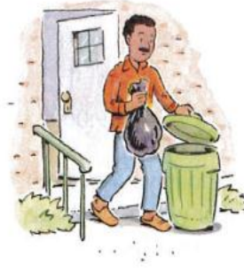
4. take out the garbage