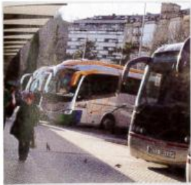
1. a bus station

Escribe 6 preguntas con sus repuestas usando "Where" y el vocabulario debajo.