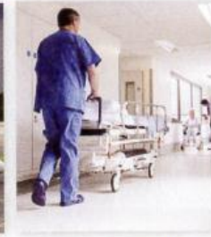
8. a hospital