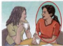
2 a friend