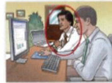
5 a colleague