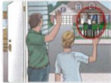
3 a neighbor