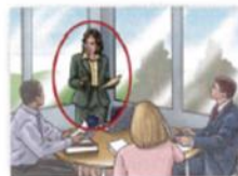
4 a boss