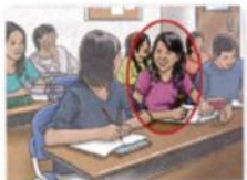
1 a classmate

Exercise 4. Traduce el siguiente vocabulario.