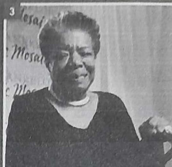
3 Maya Angelou, author (1928–2014)