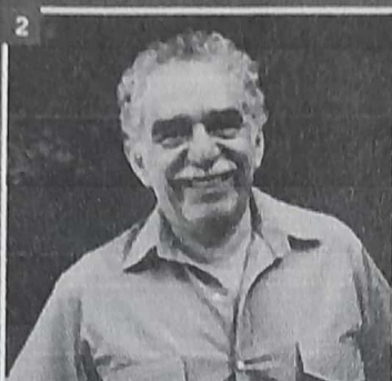
2 Gabriel García Márquez, author (1927–2014)