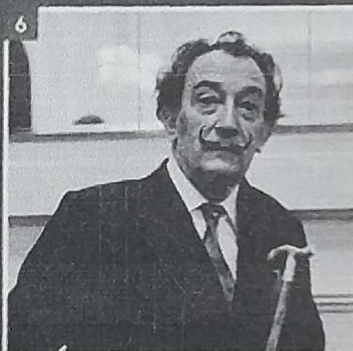
6 Salvador Dalí, artist (1904–1989)