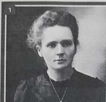
1 Marie Curie, scientist (1867–1934)