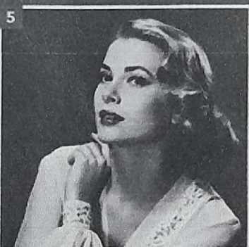
5 Grace Kelly, actress (1929–1982)