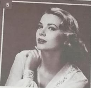
5 Grace Kelly, actress (1929–1982) • born in the U.S. • married Prince Rainier III of Monaco, 1956