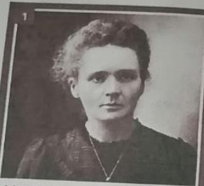
1 Marie Curie, scientist (1867–1934) • born in Poland • won Nobel Prizes in 1903 and 1911