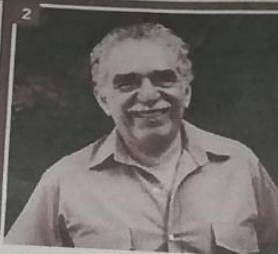
2 Gabriel Garcia Márquez, author (1927–2014) • born in Colombia • wrote One Hundred Years of Solitude , 1967