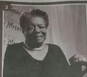
3 Maya Angelou, author (1928–2014) • born in the U.S. • wrote I Know Why the Caged Bird Sings , 1969