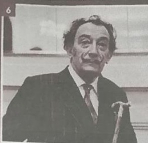
6 Salvador Dali, artist (1904–1989) • born in Spain • painted The Persistence of Memory , 1931