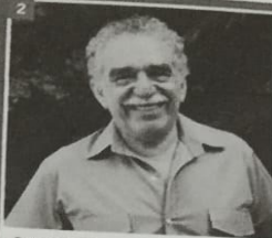
2 Gabriel Garcia Márquez, author (1927-2014) • born in Colombia • wrote One Hundred Years of Solitude , 1967