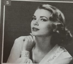
5 Grace Kelly, actress (1929-1982) • born in the U.S. • married Prince Rainier III of Monaco, 1956