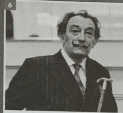
6 Salvador Dalí, artist (1904-1989) • born in Spain • painted The Persistence of Memory , 1931