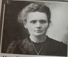
1 Marie Curie, scientist (1867-1934) • born in Poland • won Nobel Prizes in 1903 and 1911