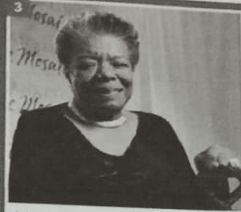
3 Maya Angelou, author (1928-2014) • born in the U.S. • wrote I Know Why the Caged Bird Sings , 1969