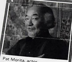
Pat Morita, actor (1932-2005) • born in the U.S. • was in the movie The Karate Kid, 1984