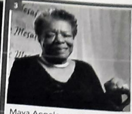
Maya Angelou, author (1928-2014) • born in the U.S. • wrote I Know Why the Caged Bird Sings, 1969