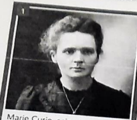
Marie Curie, scientist (1867-1934) • born in Poland • won Nobel Prizes in 1903 and 1911