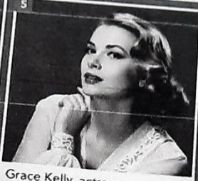
Grace Kelly, actress (1929-1982) • born in the U.S. • married Prince Rainier III of Monaco, 1956