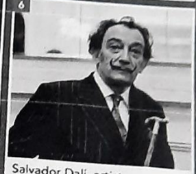
Salvador Dali, artist (1904-1989) • born in Spain • painted The Persistence of Memory, 1931