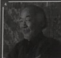
Pat Morita, actor (1932-2005) • born in the U.S. • was in the movie The Karate Kid , 1984