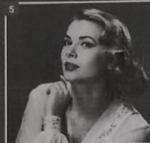
Grace Kelly, actress (1929-1982) • born in the U.S. • married Prince Rainier III of Monaco, 1956