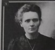
Marie Curie, scientist (1867-1934) • born in Poland • won Nobel Prizes in 1903 and 1911