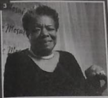
Maya Angelou, author (1928-2014) • born in the U.S. • wrote I Know Why the Caged Bird Sings , 1969