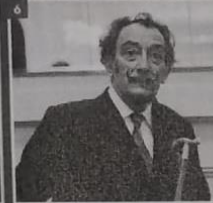
Salvador Dalí, artist (1904-1989) • born in Spain • painted The Persistence of Memory , 1931

1. Marie Curie was a scientist. She was born in 1867 in Poland. She won Nobel Prizes in 1903 and 1911. She died in 1934. 2. gabriel garcia was a author. He was born in 1927 in colombia he wrote one hundred years of solitude, she ded in 2014 3. Maya Angelou was a author. She was born in 1928 in U.S. she wrote I know why the caged Bird Sings, and 1969. She ded in 2014 4. Pat Morita was a actor. He was born in 1932 in 1932 in U.S. he was in the movie the Karate Kid. 1984. she died in 2005 5. Grace Kelly was a actress. She was born in 1929 in U.S. she was married Prince Rainier III of Nonaco, in 1956. she died in 1982 6. Salvador Dalí, was a artist. he was born in 1904 in Spain he was painted the persistence of Memory in 1931, he died in 1989