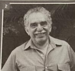
2 Gabriel Garcia Márquez, author (1927-2014) • born in Colombia • wrote One Hundred Years of Solitude , 1967