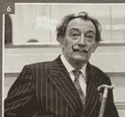
6 Salvador Dali, artist (1904-1989) • born in Spain • painted The Persistence of Memory , 1931