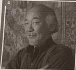
4 Pat Morita, actor (1932-2005) • born in the U.S. • was in the movie The Karate Kid , 1984