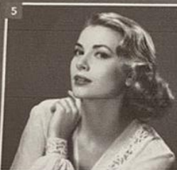
5 Grace Kelly, actress (1929-1982) • born in the U.S. • married Prince Rainier III of Monaco, 1956