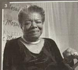
3 Maya Angelou, author (1928-2014) • born in the U.S. • wrote I Know Why the Caged Bird Sings , 1969