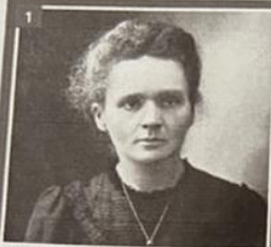
1 Marie Curie, scientist (1867-1934) • born in Poland • won Nobel Prizes in 1903 and 1911

3 Write four sentences about each person.