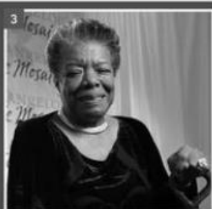
Maya Angelou, author (1928–2014)