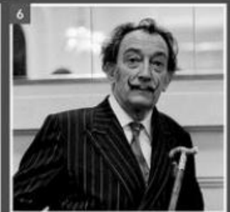
Salvador Dalí, artist (1904–1989)