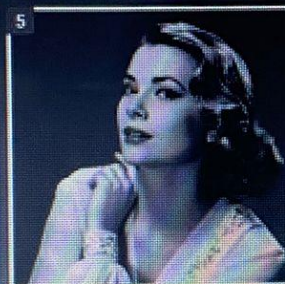
Grace Kelly, actress (1929–1982) • born in the U.S. • married Prince Rainier III of Monaco, 1956