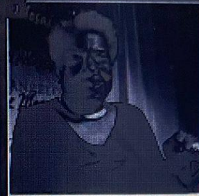
Maya Angelou, author (1928–2014) • born in the U.S. • wrote I Know Why the Caged Bird Sings , 1969