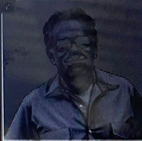
Gabriel García Márquez, author (1927–2014) • born in Colombia • wrote One Hundred Years of Solitude , 1967