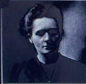
Marie Curie, scientist (1867–1934) • born in Poland • won Nobel Prizes in 1903 and 1911