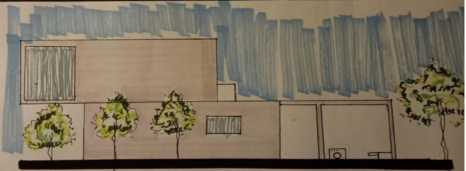
FACHADA LATERAL DERECHA