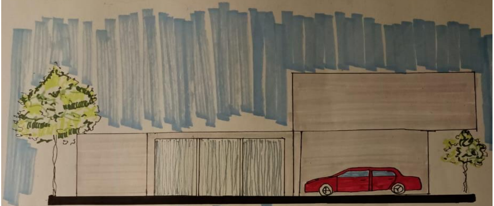
FACHADA LATERAL IZQUIERDA