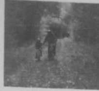
1. They're going to go bike riding.

A What are these people going to do next weekend? Write sentences.