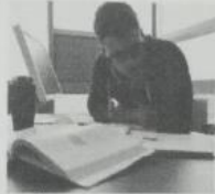
5. He's going to reading a book