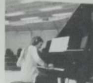
3. She's going to take a piano