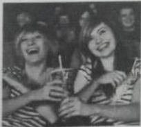
7. They're going to to the cinema