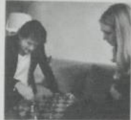
6. They're going to playing chess.