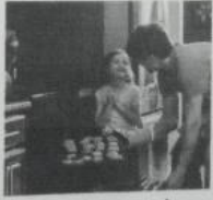
8. they're going to play