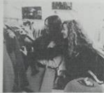
4. They're going to the shopping