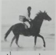
9. He's going to riding a horse

B What are you going to do next weekend? How about your family and friends? Write sentences.