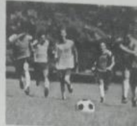
2. they're going to play football