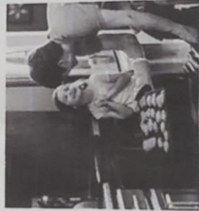
8. they're going to make deserts.