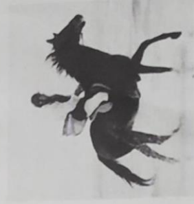
9. going for ride.

B What are you going to do next weekend? How about your family and friends? Write sentences.