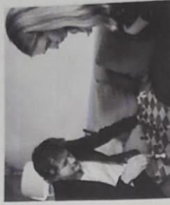
6. they're going to play chess.