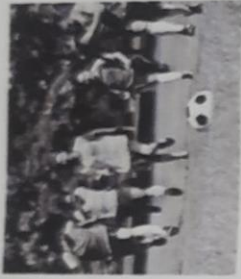
2. They're going to play soccer.