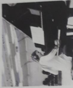
3. he will play the piano.