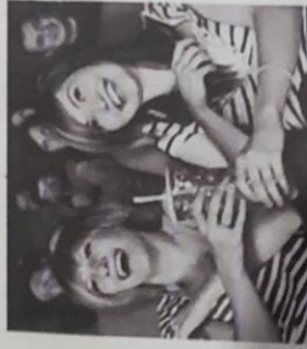
7. they will go to the cinema.