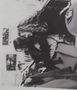
4. they will go shopping.