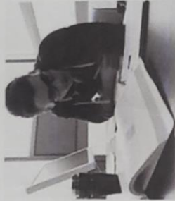
5. he will study.