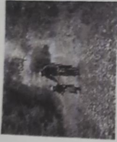
1. They're going to go bike riding.

A What are these people going to do next weekend? Write sentences.