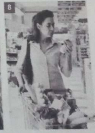
go grocery shopping