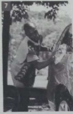
wash the car