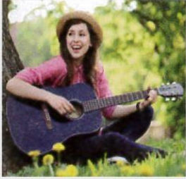
Carrie can play the guitar.

We use "can" or "can't" + the base form of a verb to talk about ability.