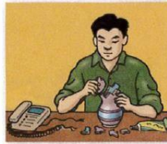
12. fix things

Exercise 1. Translate to Spanish the vocabulary above. Traduce al español el vocabulario de arriba.