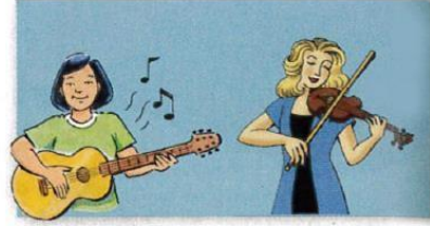
4. play the guitar/ the violin