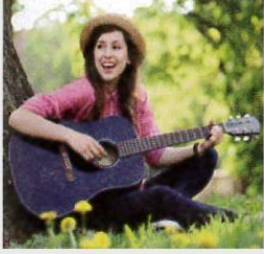
Carrie can play the guitar.

We use "can" or "can't" + the base form of a verb to talk about ability.