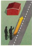
2. down the street