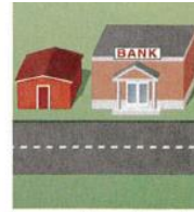
6. next to the bank