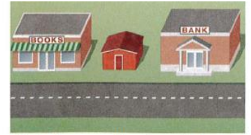
7. between the bookstore and the bank