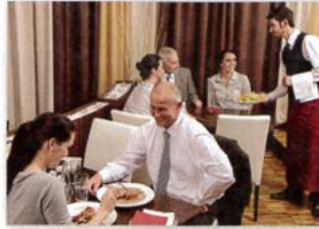
2. a restaurant