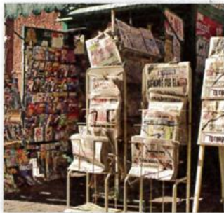
5. a newsstand