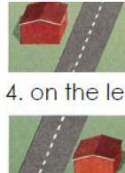
4. on the left