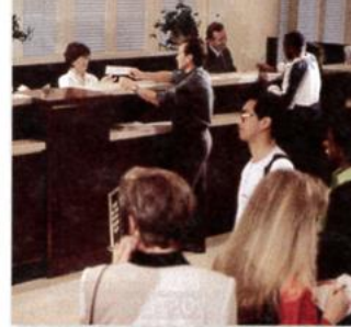
3. a bank