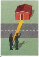
1. across the street