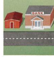
6. next to the bank