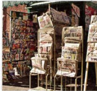
5. a newsstand