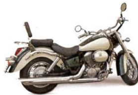
5. a motorcycle