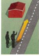
2. down the street