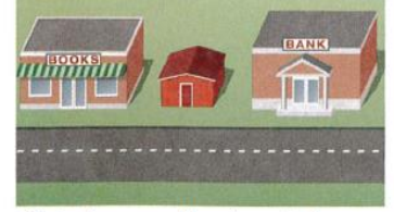
7. between the bookstore and the bank