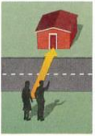
1. across the street