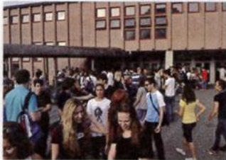
4. a school