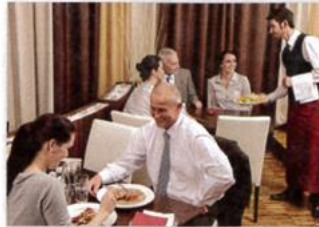
2. a restaurant