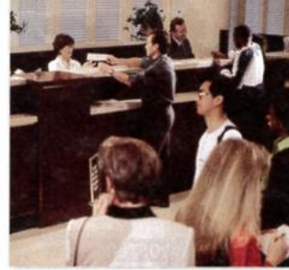
3. a bank