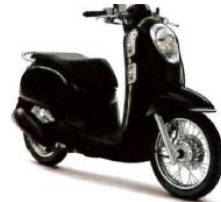
3. a moped