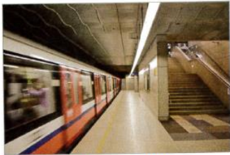
4. a subway