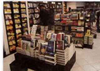
6. a bookstore

Exercise 1. Translate to Spanish the vocabulary above (Traduce al español el vocabulario de arriba).