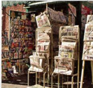
5. a newsstand