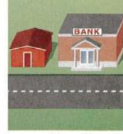
6. next to the bank