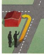
3. around the corner