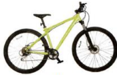
2. a bicycle