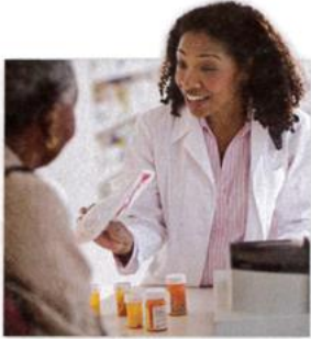
1. a pharmacy