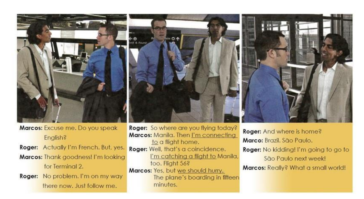
Exercise 3. Circle T (true), F (false) or NI (no information). Then explain each answer.

TF NI 1. Flight 56 leaves from Terminal 2.