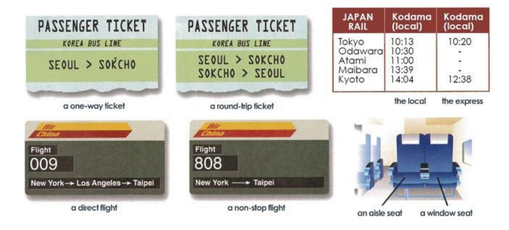
Exercise 4. Translate the next vocabulary to Spanish – Traduce el siguiente vocabulario al español.

NI 6. The two men get to the flight on time.