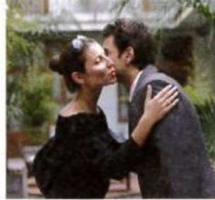
Some people kiss once. Some kiss twice.