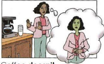
Coffee doesn't agree with me.