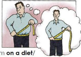
I'm on a diet / I'm trying to lose weight .