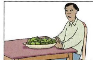
I don't care for broccoli.

Exercise 5. Escribe 7 oraciones usando las palabras en negritas.