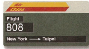
a non-stop flight