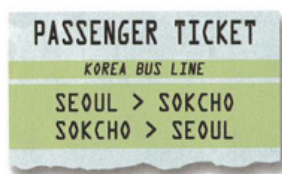
a round-trip ticket