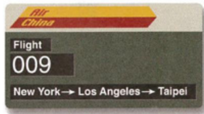
a direct flight