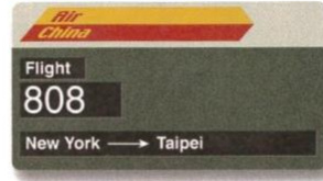
a non-stop flight