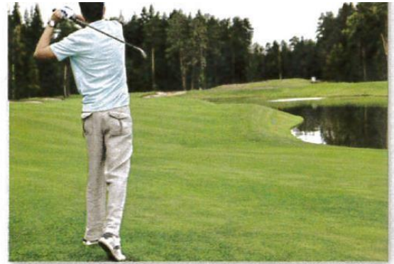
a golf course