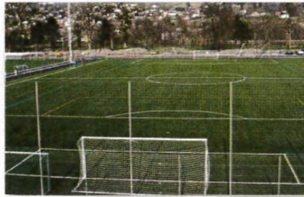
an athletic field