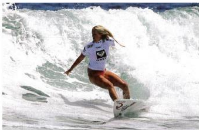
Hamilton was attacked by a tiger shark when she was thirteen.

In 2011, Hollywood made a movie about her experience. Bethany has a happy life and got married in 2013.