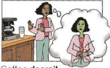
Coffee doesn't agree with me.