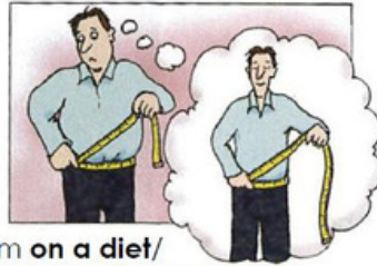
I'm on a diet/ I'm trying to lose weight.