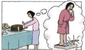
I'm avoiding sugar.