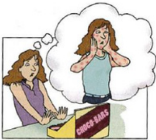
I'm allergic to chocolate.