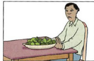
I don't care for broccoli.

Exercise 5. Escribe 7 oraciones usando las palabras en negritas.