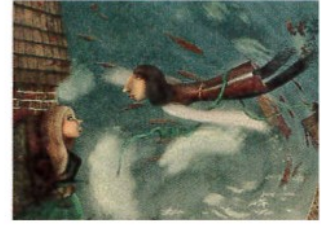
an animated film