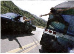
an action film