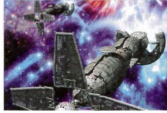
a science-fiction film