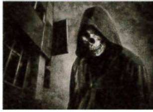
a horror film