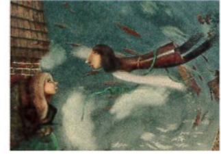
an animated film