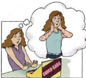
I'm allergic to chocolate.