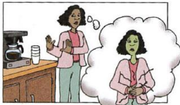
Coffee doesn't agree with me.