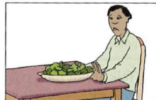
I don't care for broccoli.

Exercise 5. Escribe 7 oraciones usando las palabras en negritas.