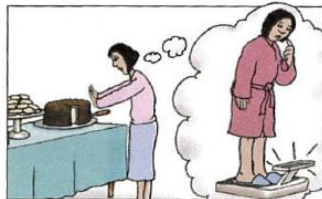
I'm avoiding sugar.