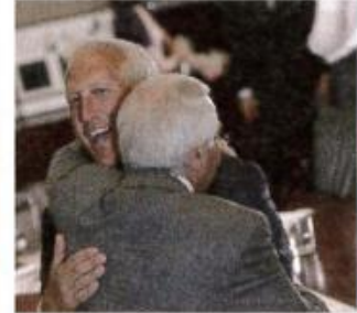
and some hug.