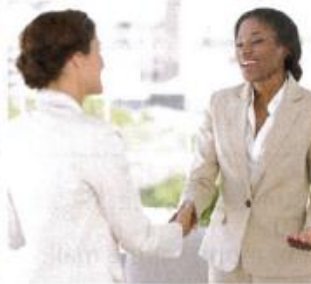
Some shake hands.