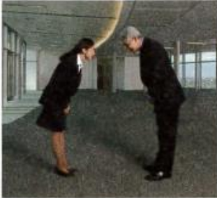
Some people bow.

People greet each other differently around the world.