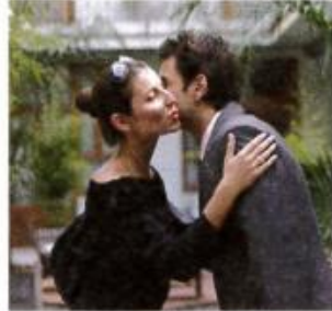
Some people kiss once. Some kiss twice.