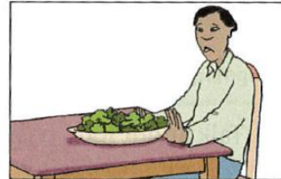
I don't care for broccoli.

Exercise 5. Escribe 7 oraciones usando las palabras en negritas.