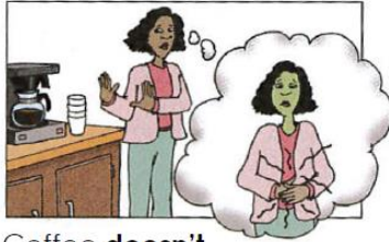
Coffee doesn't agree with me.