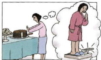
I'm avoiding sugar.