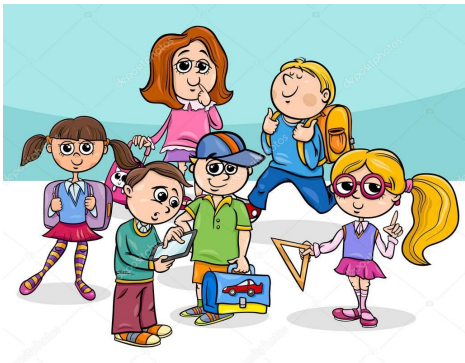
17.- I DIDN'T MAKE THE SURPRISE PARTY