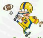
football American football