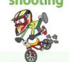
downhill mountain biking