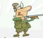
clay (target) shooting