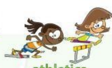
athletics (track and field)