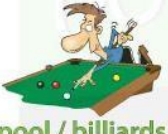
pool / billiards