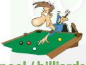
pool / billiards