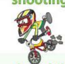
downhill mountain biking