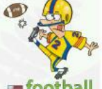
football American football