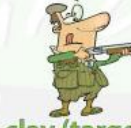
clay (target) shooting