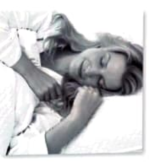
1. She's sleeping