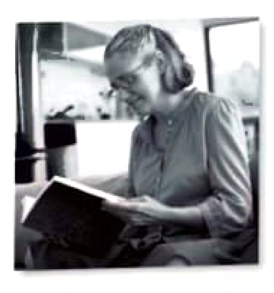
She's is reading a book