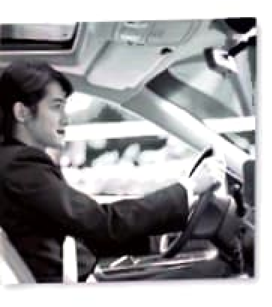
He's is driving