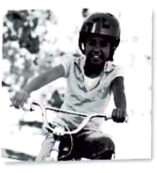
She's is driving the bike