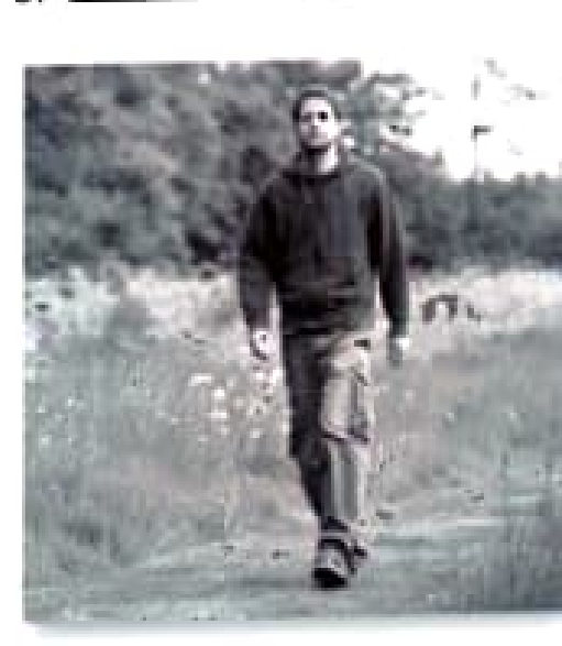
5. We're is take a walking