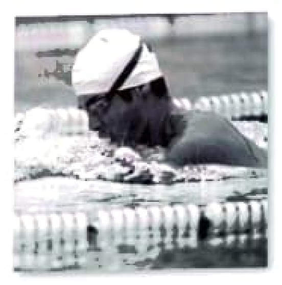
He's is swimming