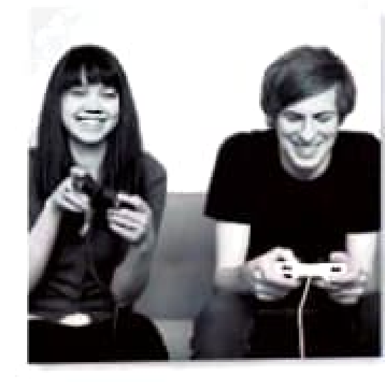
3. They're playing video games